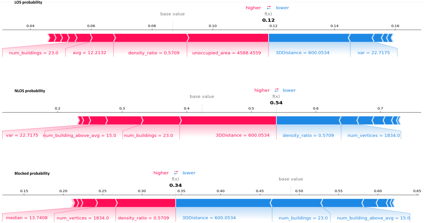
Fig. 3: SHAP force plots for the section under analysis.